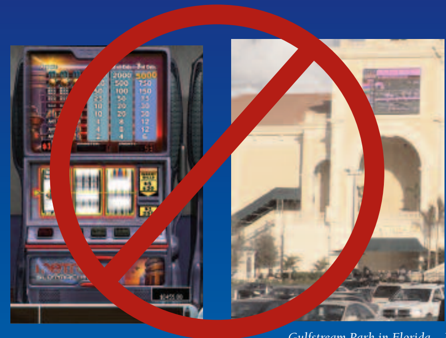
Gulfstream Park in Florida – Magna's "RACINO"

Sign up with Citizens for East Shore Parks www.EastShorePark.org Phone: 510-461-4665 Email: EastShorePark@hotmail.com P.O. Box 6087 Albany, CA 94706