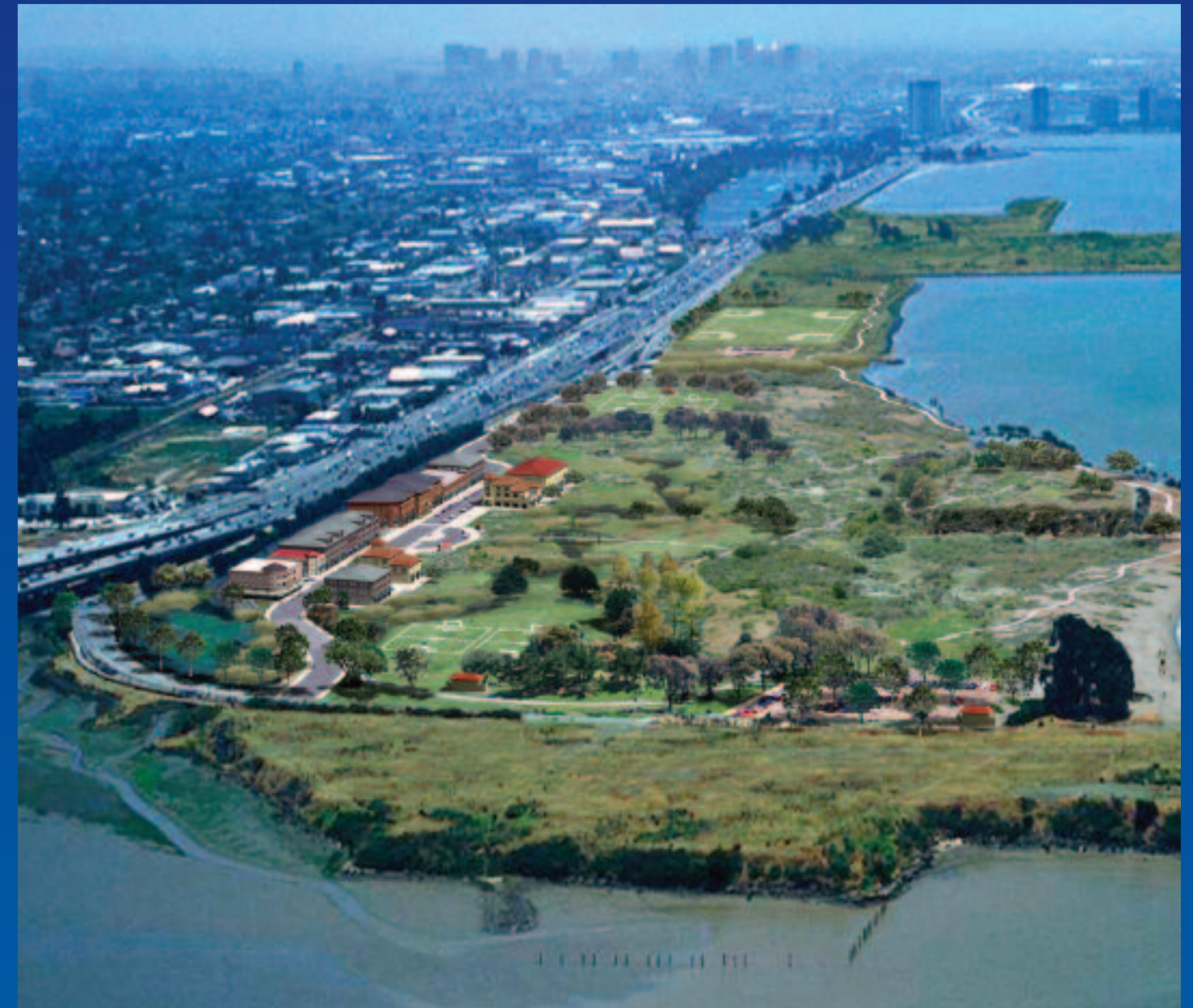
Artist rendering of a low-density development plan that would bring more tax revenues to Albany, both the city and the school district, while protecting shoreline open space.

JOIN THE PLANNING PROCESS TO PRESERVE OUR SHORELINE AND PROTECT ALBANY'S ECONOMY